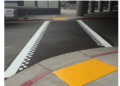
Enhanced crosswalk area

nature of fresh concrete and unfortunately, the first concrete placed in the plaza area did not meet the slope percentages. However, Sustainable Group persevered to work closely with the concrete subcontractor and BART to replace this concrete at the correct slope and at no additional cost to the District.