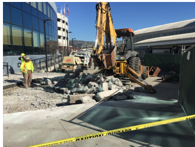
Existing concrete removal

Similarly, an adjacent handicap ramp was reconstructed to the same exact slope percentages. This is a very difficult task given the liquid