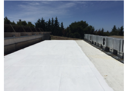
Armored steel roof

scope of work. This delay revolved around the contract requirement to use several reference documents, one of which required the use of frangible ammunition. However, the unit did not concur with the switch to frangible ammunition (which disintegrates on contact) and thus some time was needed to develop an agreeable approach with all the project stakeholders to meet the project goals while staying within the funding limits for the project.