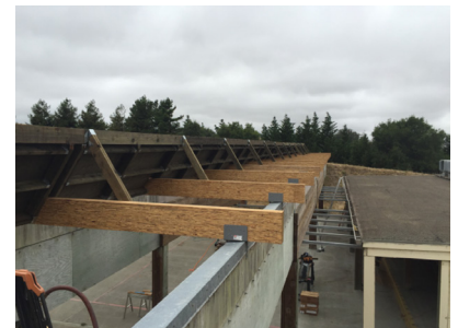
Completed baffle construction