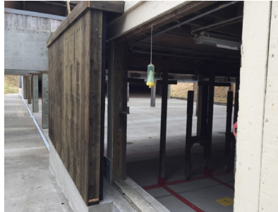
Armored steel side wall

Sustainable Group is a Service Disabled Veteran Owned Small Business Corporation.