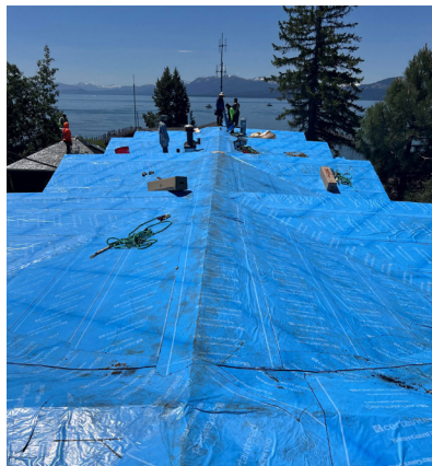
Roofing Underlayment Installation

In addition, Sustainable Group forces self-performed most of the elements of work (demolition, window replacement, framing, drywall, tile, etc.) with the exception of the roofing and the restroom plumbing.