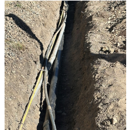
Sewer Line Repairs