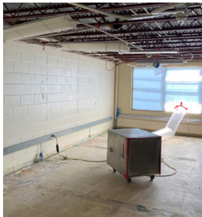
Existing Berthing/Lounge Areas

Sustainable Group key personnel performed overall project management, on-site construction management, field superintendence, safety oversight, and Quality