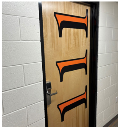
New Lounge/Berthing Room Entry Doors

Control/Quality Assurance (QA/QC) services throughout the several month duration of this project that was completed without any safety or quality control incidents of any kind.